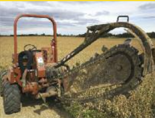
The Largest Trencher Wear Parts Inventory in the Industry