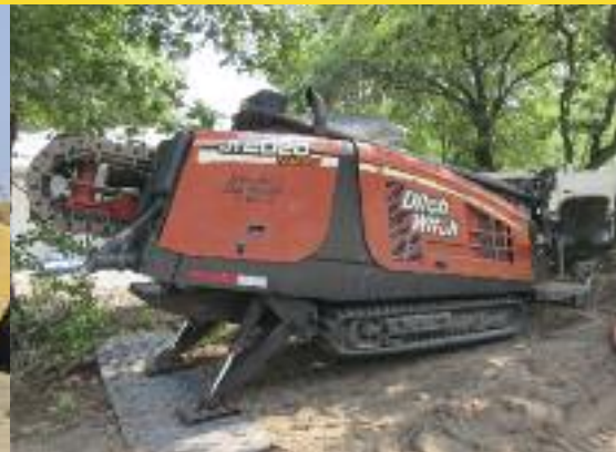
Horizontal Directional Drill Pipe and Tooling