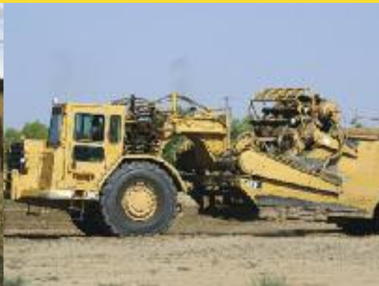
The Broadest Selection of Chains, Sprockets, Rollers and Flights for Scrapers